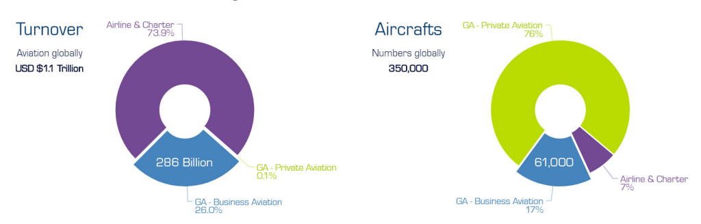
Figure 1: Total market of aviation

Currently, around 350,000 aircraft are operated worldwide. Of these, around 93% or 325,000 aircraft are used by General Aviation. Of these, 61,000, which is 17% of all aircraft worldwide for business aviation and about 76% or 266,000 aircraft worldwide for the rest of general aviation (private aviation and others). Only around 7% or 25,000 aircraft cover the scheduled and charter segment.(Aircraft, 2015; BLD, 2018; Fly, 2013; GAMA, 2017)