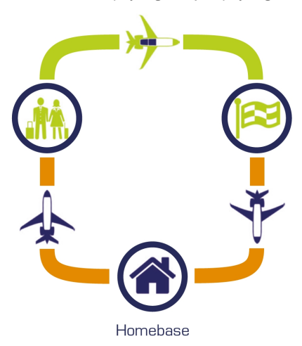
Figure 2: Scheme of classic empty flights (empty legs, depicted in orange)